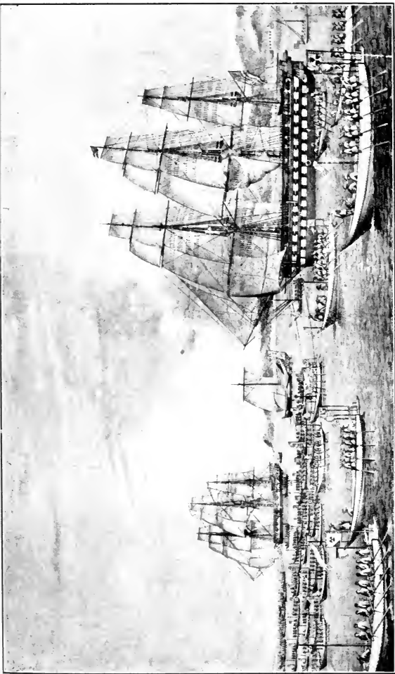
U. S. FRIGATE COLUMBUS AND U. S. SLOOP OF WAR VINCENNES Being towed out of port by Japanese row-boats 1844